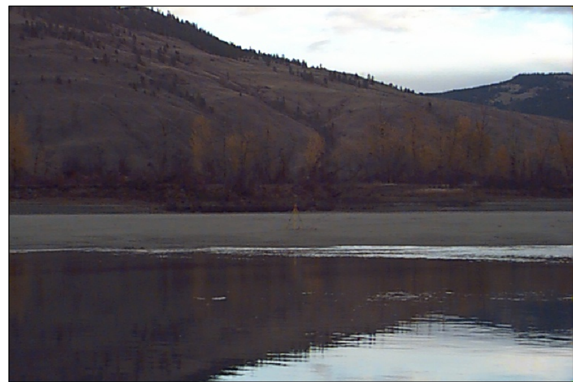
LEFT BANK VIEW