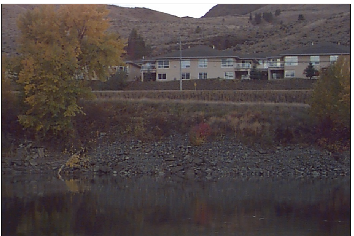
RIGHT BANK VIEW

NOTE: This information is considered historical as it represents channel conditions and configuration at the time of the survey only. User must accept responsibility of ensuring that the accuracy and completeness of provided data is suitable for the needs of the project or study. It is provided "as is" without warranty of any kind, whether express or implied. Under no circumstances will the Government of British Columbia be liable to any person or business entity for any direct, indirect, special, incidental, consequential, or other damages based on any use of this information.